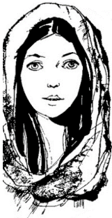
Mary is the Mother of Jesus Марія - Мати Ісуса