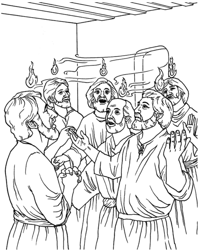
The Day of Pentecost - Acts 2