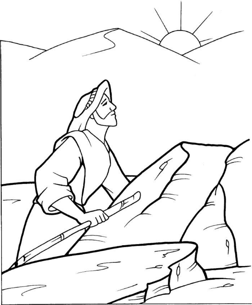
Jesus in the wilderness