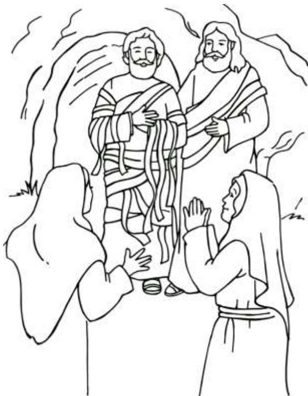
Jesus Raises Lazarus