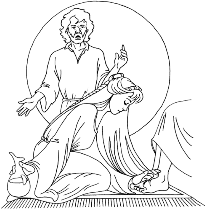
Mary Anoints Jesus' Feet John 12:1-8