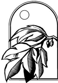
Parable of the Fig Tree - Luke 13:1-9