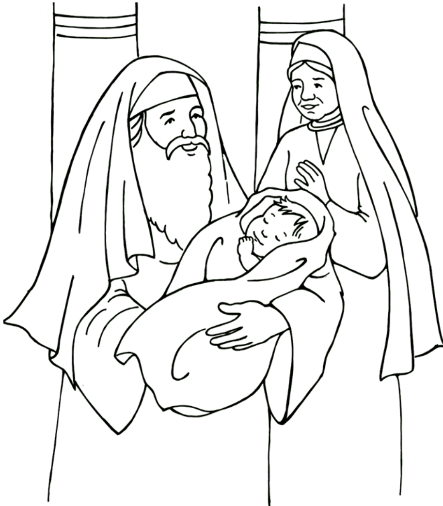
Simeon and Anna Thank God Luke 2