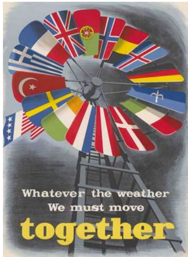
A NATO Poster from 1950

Please pray for continuing peace and ever greater understanding between the peoples of the world