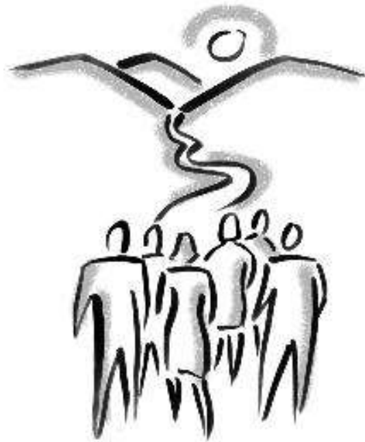
The Road to Emmaus