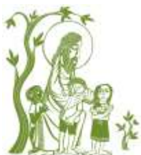
Trinity 19 (Mark 10: 14)