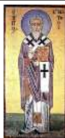
Ignatius of Antioch