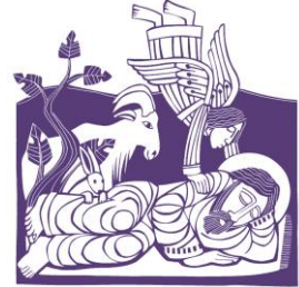
Noah (Gen 9.8–17; 1 Pet 3.18–end)