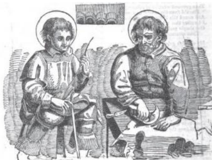
Crispin and Crispinian, martyrs, c.287