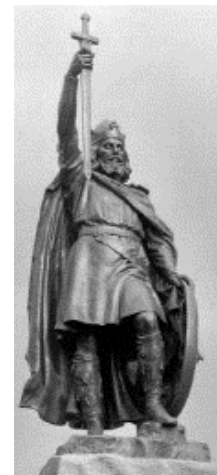
Alfred, king, scholar, 899