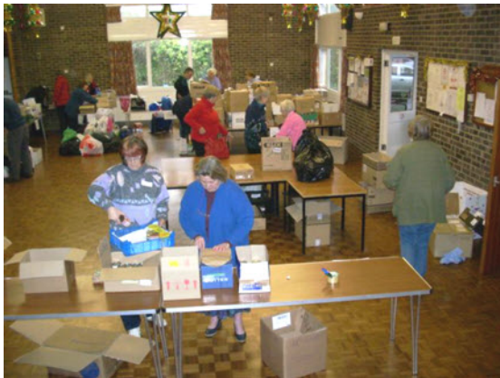
Packing the gifts in Waltham Chase Village Hall