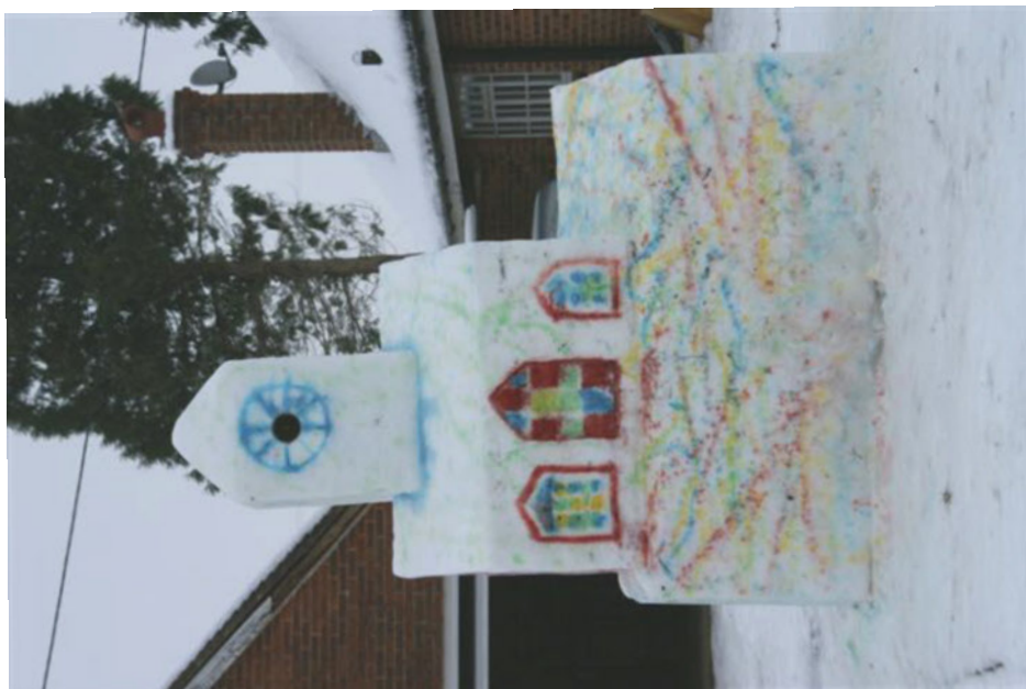
The snow church at Townsend, North End Lane, Droxford circa 7th Jan 2010